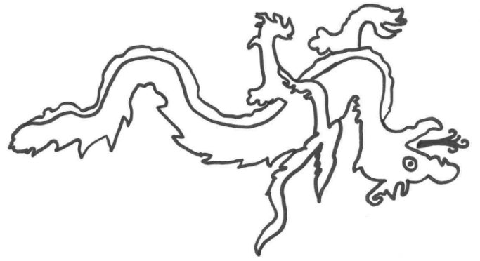
Draco Constellation - Persia